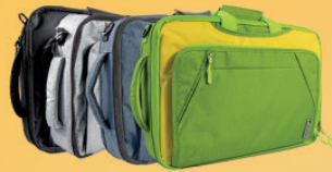
Transport bag TBX-2 for 50 devices