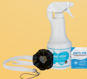
Hygiene accessories disinfection sprays, covers, lanyards