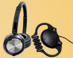
Reusable earphones headband and on-ear