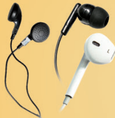
Disposable earphones earbud and in-ear