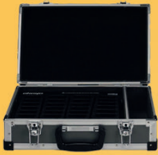
Portable charger HDC-324 for 24 devices