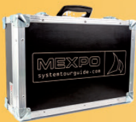
Transport case AC-360 up to 60 devices