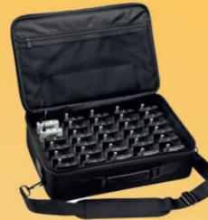
Transport bag TB-350 for 30/50 devices