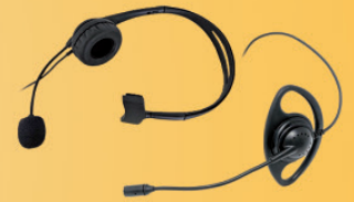
Headsets behind-the-head, headband, on-ear